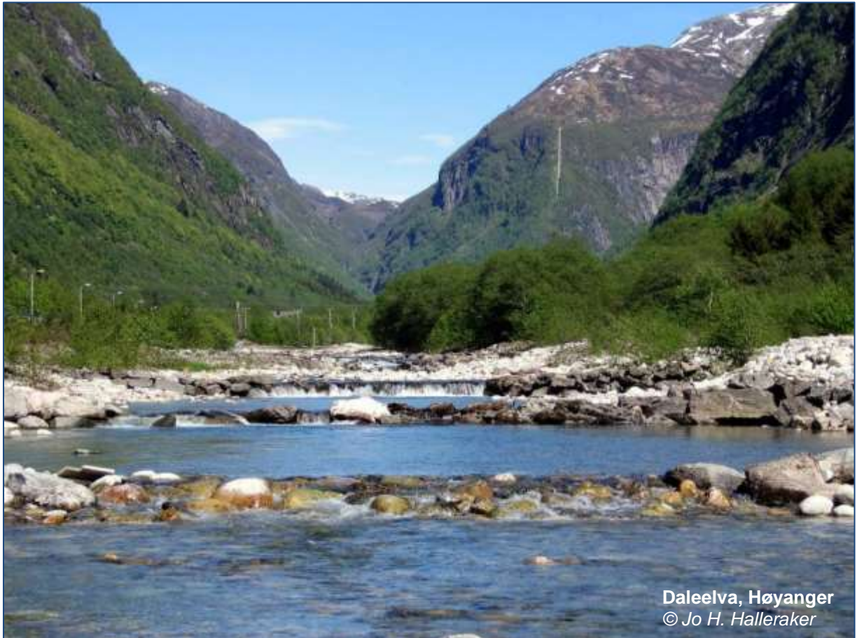
Daleelva, Høyanger