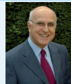
Stavros Dimas Commissioner for Environment

With this Conference, the EU participates in the celebrations for the World Water Day of 2007, which is dedicated to "Coping with water scarcity". This is a very timely, urgent and serious problem.